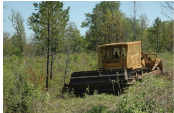
Drum-chopping can be used to set-back succession where shrubs and trees have gotten too large to allow disking or mowing and where the application of prescribed fire is not an option.