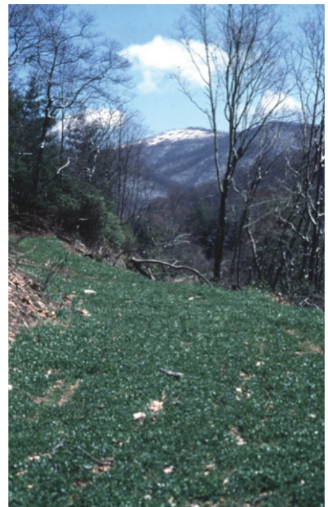
Forest roads, such as this one planted to clovers, provide nutritious forage as well as travel corridors for various wildlife species.