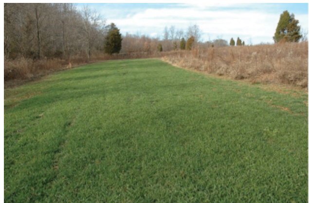
Cool-season food plots provide nutritious forage fall through spring when availability of naturally occurring forages may be relatively low. Depending on what is planted, such as this winter wheat, a nutritious seed source also is available the following late spring through summer.