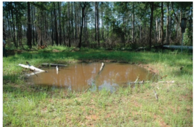
Small ponds can be created where water is relatively scarce to provide water and habitat for several wildlife species.

NOTE: these ponds are designed for various wildlife species, not fish.