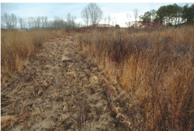
Disking sets back succession, facilitates decomposition, provides bare ground, and stimulates the seedbank, encouraging early successional species.