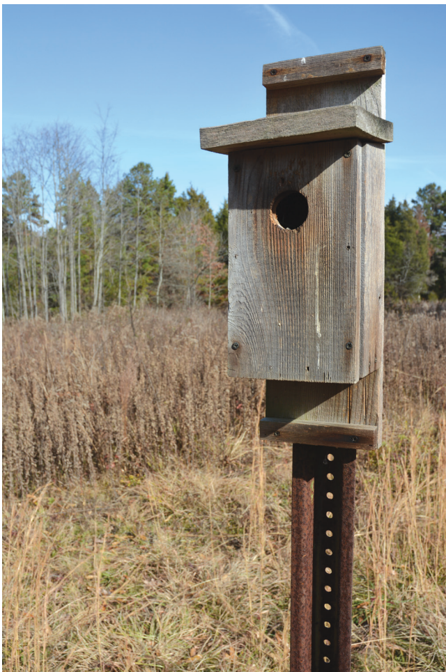
Nest boxes provide artificial cavities for several species of birds. Nest boxes have been instrumental in helping bluebird and wood duck populations recover from drastically low levels in the early 1900s.

The size and shape of food plots and their distribution is largely determined by the focal species and habitat quality. Food plots may be long and narrow (150 to 400