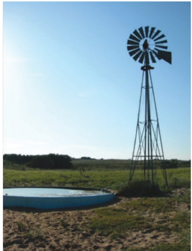
Windmills are often used in the western U.S. to provide a water source for many wildlife species.