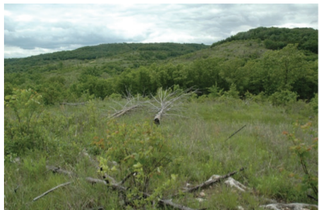
Chainsawing can be used to increase early successional vegetation in wooded areas. On this property, trees were cut, not harvested, and the site has been burned every 2 years to maintain an early succession. Nothing was planted. A forest was converted to an early successional plant community.

Forest Management should be recommended to manage and maintain a forest, either through Forest Regeneration or Forest Stand Improvement practices. Indeed, herbaceous cover (such as native grasses and forbs) is stimulated when trees are cut and seed from the seedbank germinates. However, the herbaceous community is short-lived and woody species quickly dominate the site (especially on hardwood-dominated sites) unless tree removal is followed with additional treatment. Root-plowing following removal of hardwood