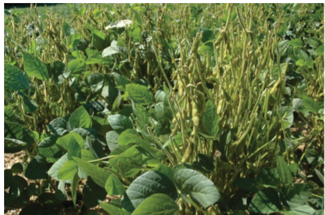
Warm-season forage plots, such as these soybeans, can provide an excellent source of protein (leaves) during summer and an energy source (beans) in winter.