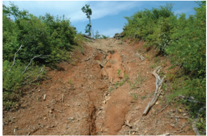
Forest roads should not be constructed perpendicular to slope. Roads such as this should be closed and planted to trees or shrubs.

Vegetation, whether naturally occurring or planted, on forest roads cannot stand very much vehicular traffic. Thus, those roads that receive considerable traffic from land managers may require gravel. Forest roads should be gated where they intersect public roads to prevent trespassing and poaching (killing wildlife illegally).