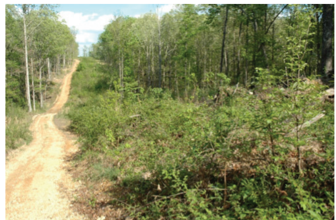
This forest road was daylighted to provide additional browse, soft mast, and nesting cover for various wildlife species. The road was graveled to prevent erosion because it receives considerable traffic from land managers.