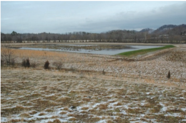
Shallow impoundments can provide excellent habitat for migrating and wintering waterfowl and other wildlife species.

NOTE: Water Developments for Wildlife can be recommended when an additional water source is needed or when an existing water development for wildlife is essentially not functioning to hold water or to provide water for a focal species because it is in serious need of repair.