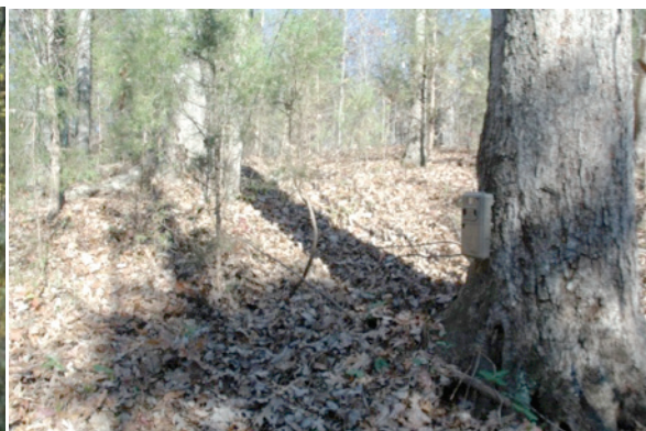
Infrared-triggered cameras are a great tool to survey populations of several wildlife species.