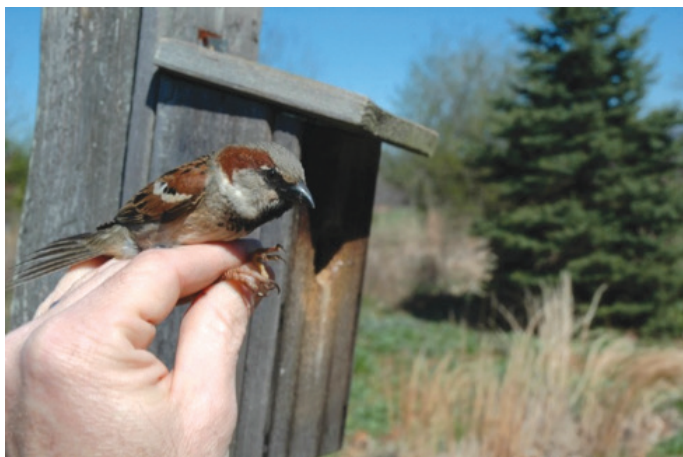
House sparrows often displace bluebirds from nest boxes constructed for bluebirds. This invasive nonnative species should be removed whenever possible.

Although not common, Wildlife Damage Management Techniques also could be required if increased harvest has not been effective. Situations can occur where local regulated hunting and trapping pressure is not able to effectively lower a population and professional wildlife damage management specialists are needed to address the situation. Examples may include population reduction for white-tailed deer, raccoon, coyote, and American beaver. The person in charge of the contest will give you clues as to which WMP ( Increase Harvest or Wildlife Damage Management Techniques ) would be most appropriate.