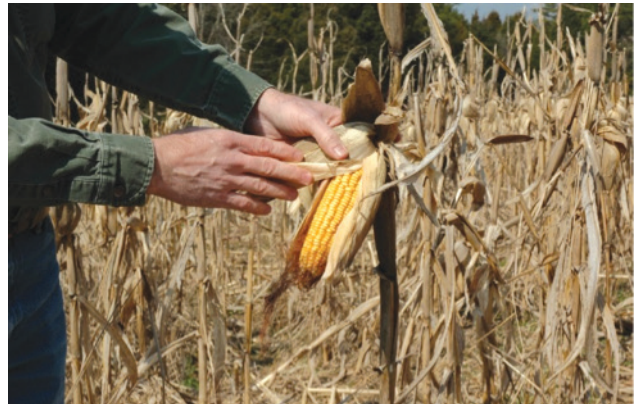
Warm-season grain plots, such as this corn, can provide an important source of energy through winter for many wildlife species.