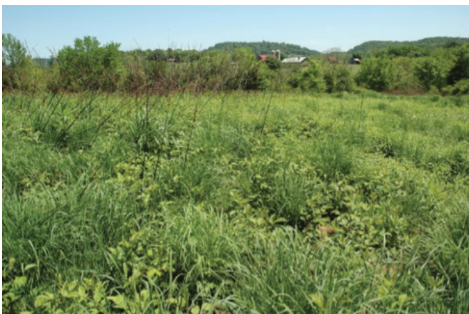
Native grasses and forbs may be planted where sufficient and desirable native grass/forb cover is lacking.

Plant Native Grasses and Forbs should not necessarily be recommended where additional early successional vegetation is needed. For example, in large forested areas where additional early successional plant communities might be required to provide habitat for some wildlife species, such as loggerhead shrike, northern bobwhite, or eastern cottontail, it is likely that desirable native grasses, forbs, brambles, and other plants will establish from