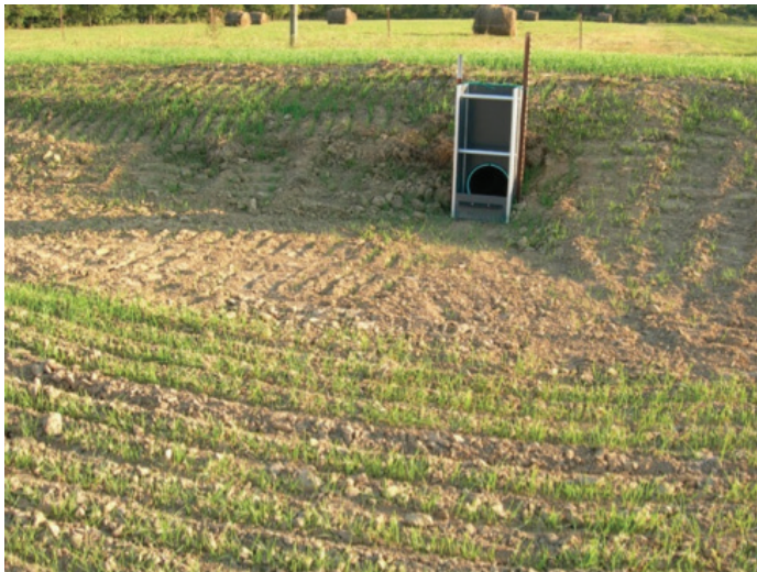
Water control structures allow manipulation of the water level in ponds and areas flooded for wildlife using a dike or levee.