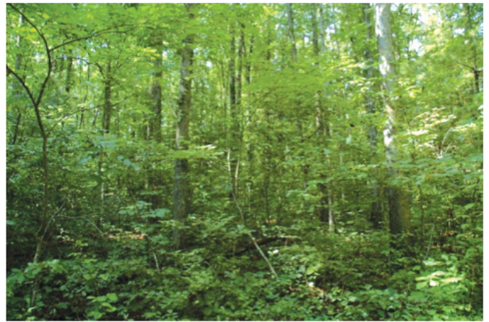
The vertical structure in this mature oak/hickory forest provides cover and food resources for a suite of forest songbird species that otherwise would not be found here.

Fragmentation is the disruption of vegetation types either by man or by natural processes. All wildlife species do not respond to fragmentation the same way. For some, the edge between a young forest and an older forest may fragment their habitat, whereas others may not respond to fragmentation except under extreme circumstances such as an interstate highway bisecting a forest or prairie or suburbia creeping into a rural area. Some species need large, unfragmented areas in a certain successional stage to provide some or all of their habitat requirements. Such species are referred to as area-sensitive. For these species, large areas in one successional stage are desirable. Unfragmented habitat of at least 100 acres is considered the minimum requirement for many area-sensitive species. Some species, such as the grasshopper sparrow, may require a minimum of 1,000 acres of relatively unfragmented habitat to sustain a viable population. Others, such as the greater prairie-chicken, may require 30,000 acres of relatively unfragmented