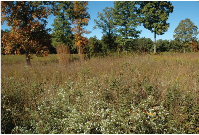
Oak or pine savannas represent early successional vegetation with scattered trees. However, without continued fire, savannas will succeed into forests.

grasslands, savannas, woodlands, and forests all occur. Grasslands are areas dominated by grasses and other herbaceous plants (forbs, sedges, and brambles) and few if any trees. Savannas and woodlands are areas with sparse to moderate tree cover and a well-developed groundcover of herbaceous plants. Forests are dominated by tree cover. In areas with abundant precipitation, grasslands, savannas, and woodlands will succeed into forests if not continually disturbed (usually with fire). When evaluating a savanna or woodland in these areas, it is not important to define the successional stage. Instead, evaluation of the structure and composition of the plant community and whether it provides habitat for the wildlife species under consideration is most important.